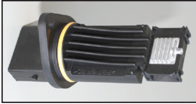
Air mass flow sensors such as the PB-LMS by EngineSens work on the principle of the hot-film anemometer. The manufacturer said that they are often used in cogeneration plants to monitor the soot in the exhaust gas duct in the area before the heat exchangers.

the loading of filters can be determined relatively accurately with modeling techniques. If — in case of a malfunction — more soot is accumulated than predicted, the best solution is to detect an early rise of the exhaust gas backpressure with a differential pressure sensor. In addition to that, the ash remaining in the filter system after successful regeneration can be determined more precisely,” said Carstens.