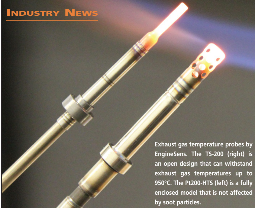
Exhaust gas temperature probes by EngineSens. The TS-200 (right) is an open design that can withstand exhaust gas temperatures up to 950°C. The Pt200-HTS (left) is a fully enclosed model that is not affected by soot particles.